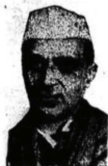
Jawahar NEW CABINET OF INDIA