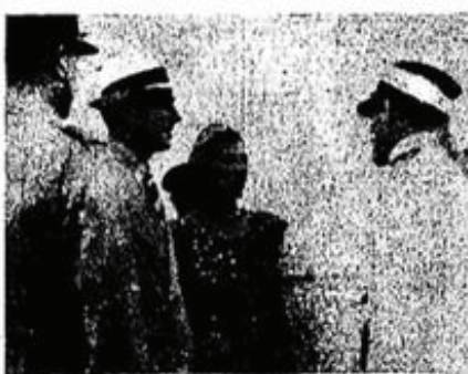
Their Excellencies Lord and Lady Mountbatten speaking to Hindus, Mohammedans, at the Maunabo Airstrip on their arrival